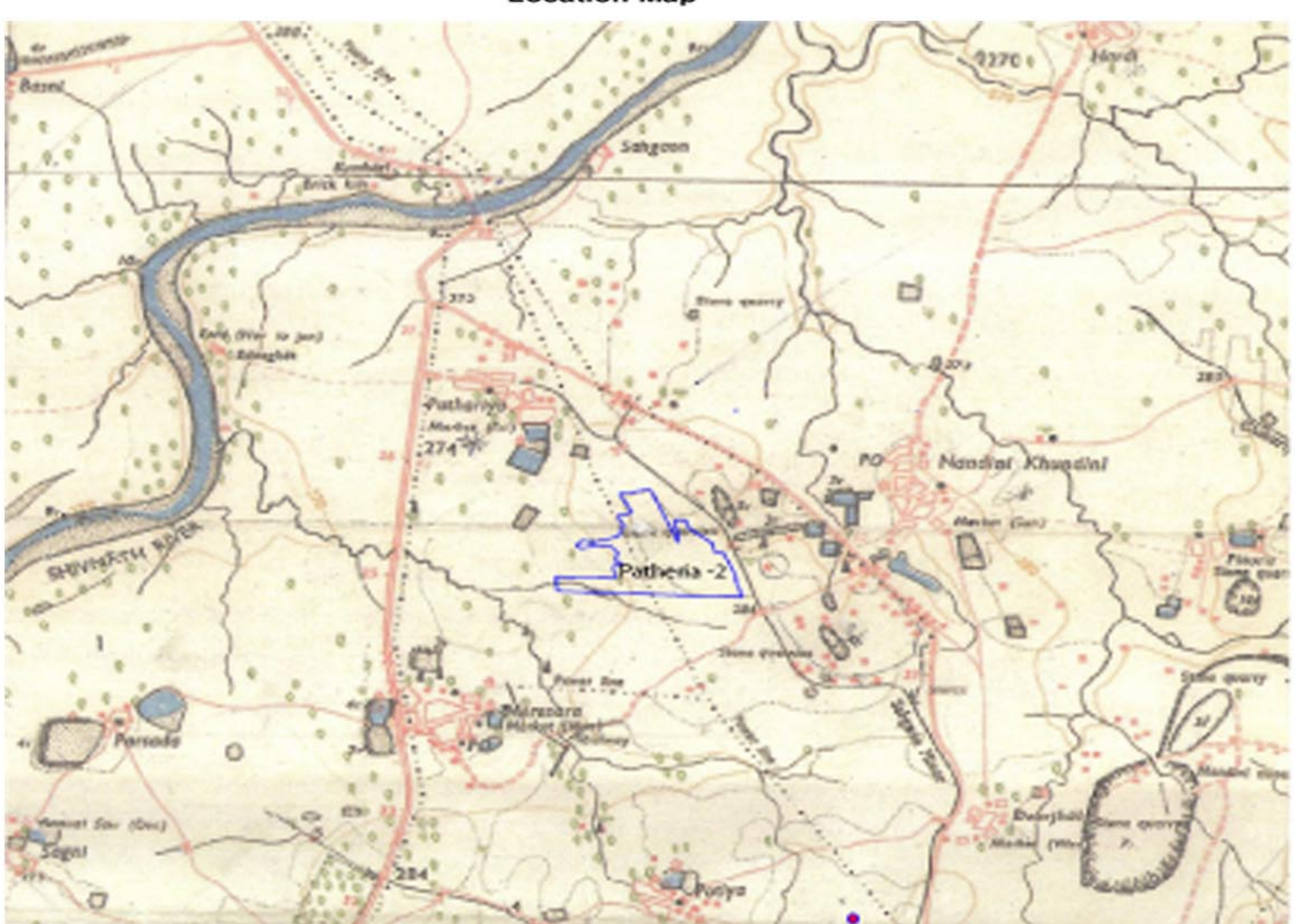
Boundary of Patheriya Mine Lease-II and Vicinity Features