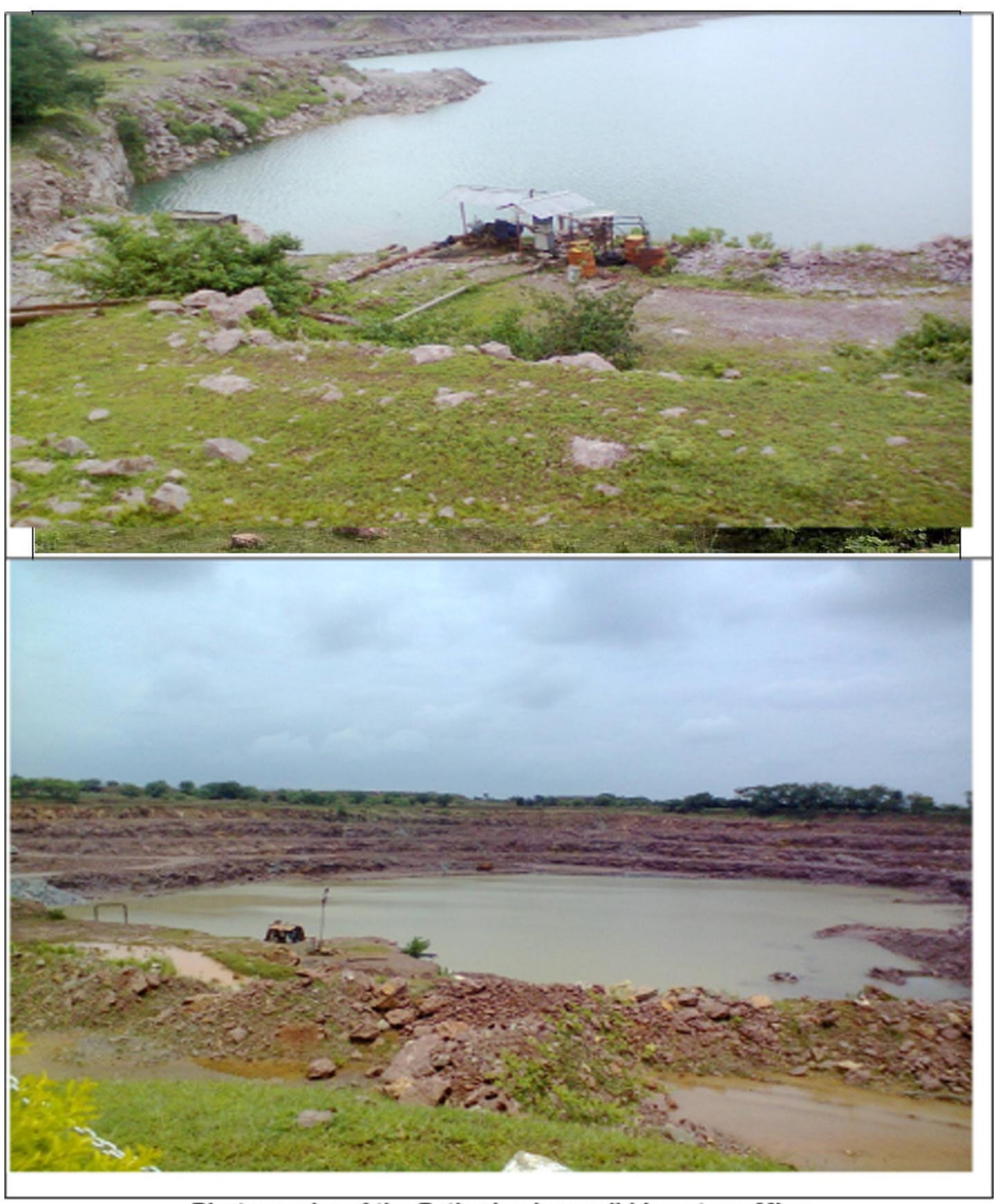
Photographs of the Patheriya Lease-II Limestone Mine